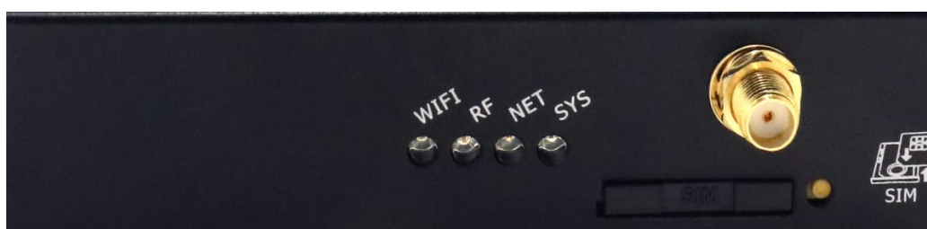
Table 4-1 LED indicator description of the H8951 4G router