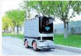
5G Smart Unmanned Vehicle