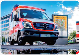
5G Smart Ambulance