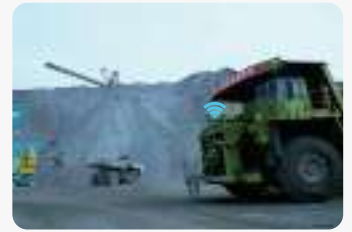
5G Intelligent Unmanned Mining Truck