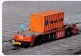
5G Smart Logistics Vehicle