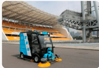
5G Smart Environmental Sanitation Vehicle