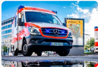
5G Smart Ambulance