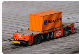
5G Smart Logistics Vehicle